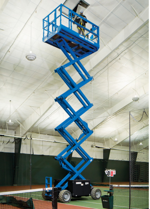
Sealed AC Drive Motors