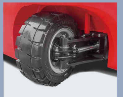
Smaller turning radius